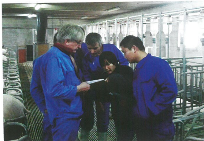
A technical and genetic audit being carried out on a foreign partner farm by Nucleus.

Late in 2015, a new Chinese farm based in Henan province was populated with Nucleus GGP animals coming from France. This farm is a joint venture between the Chinese Company Xinda Muye and the